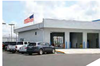
Gutters and Downspouts