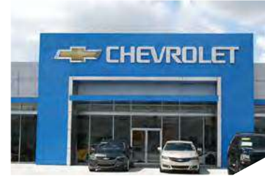
PBA Architectural Walls