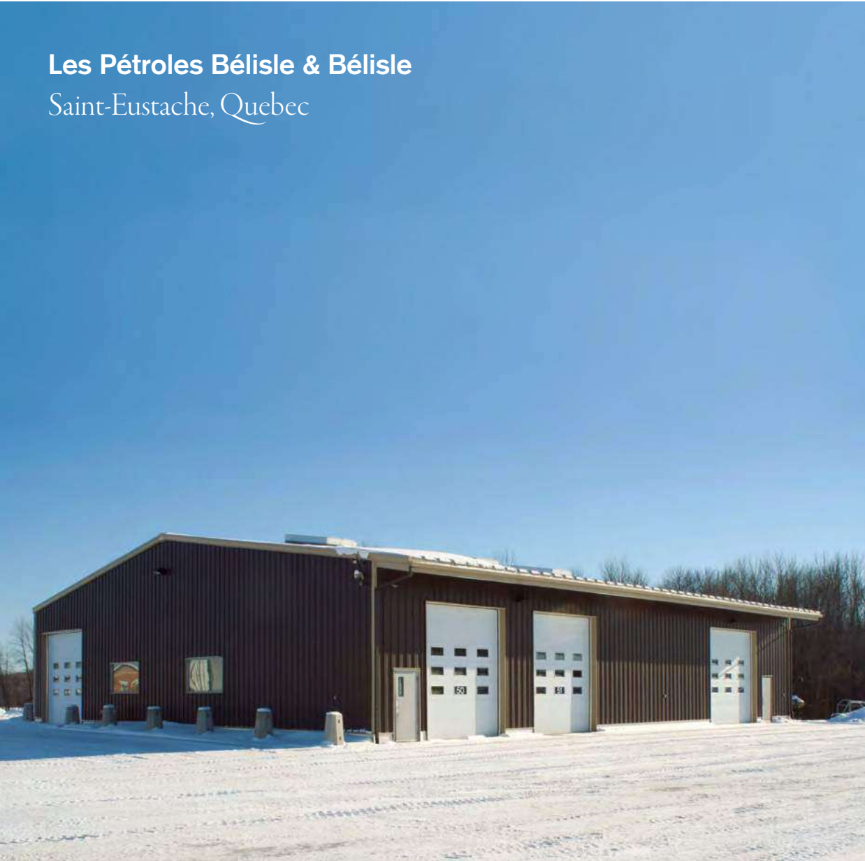
Les Pétroles Bélisle & Bélisle Saint-Eustache, Quebec