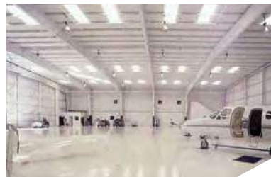
Light Transmitting Panels