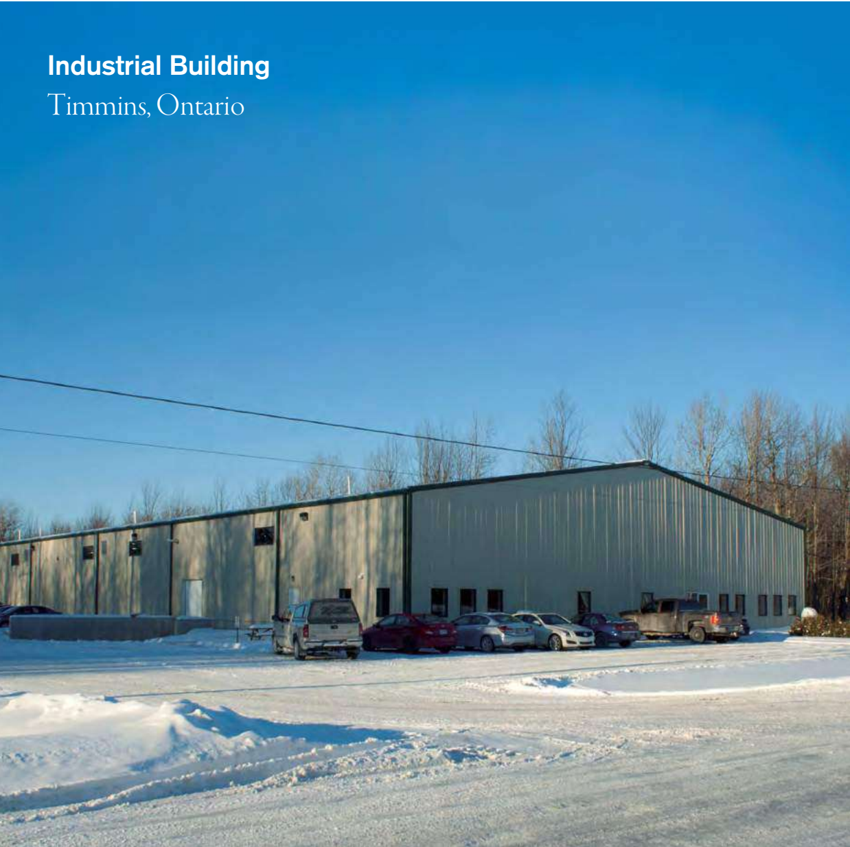
Industrial Building Timmins, Ontario