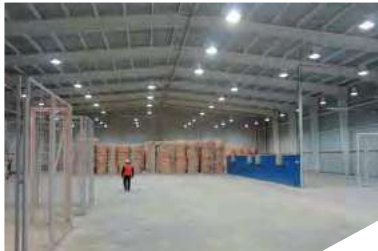
Gray Coat Primer