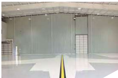
Interior Liner Panels