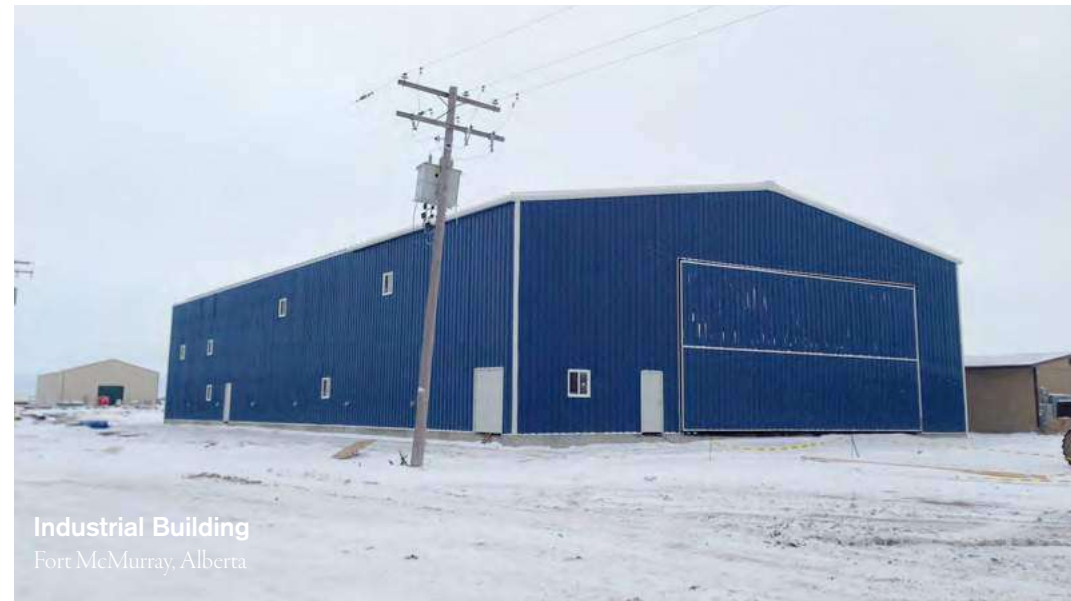
Industrial Building Fort McMurray, Alberta