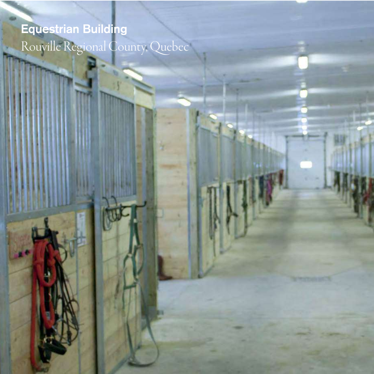
Equestrian Building Rouville Regional County, Quebec