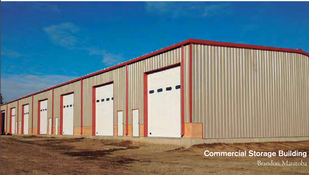
Commercial Storage Building Brandon, Manitoba