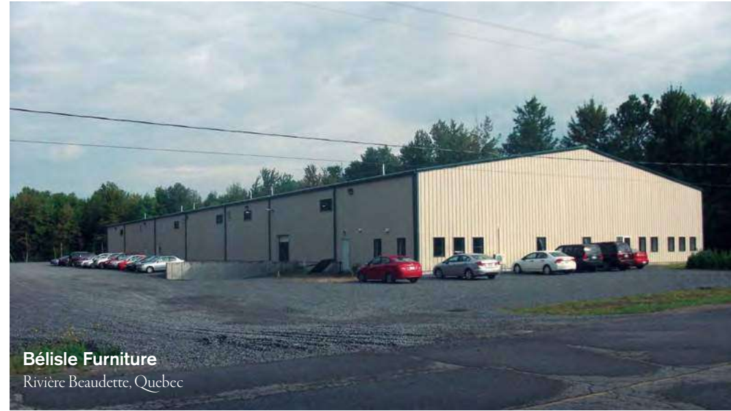
Bélisle Furniture Rivière Beaudette, Quebec