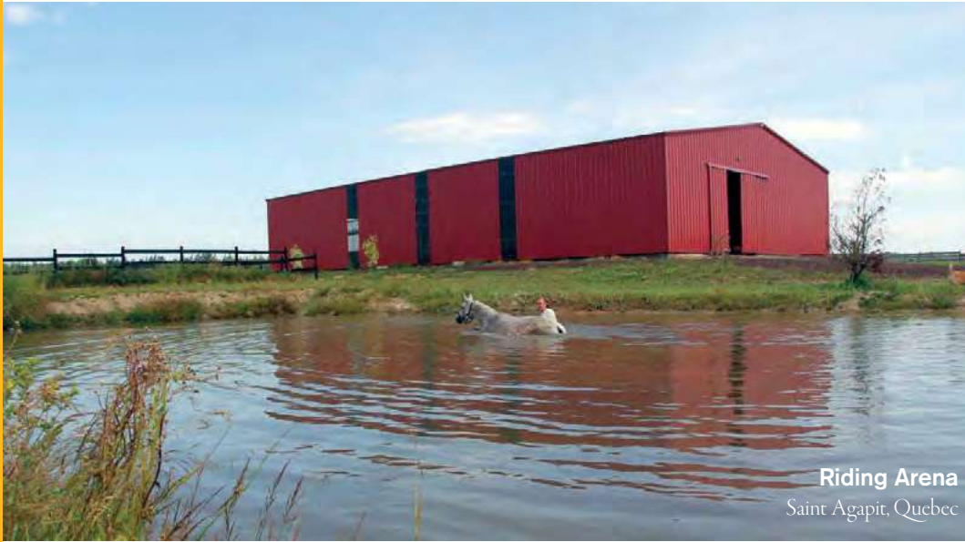
Riding Arena Saint Agapit, Quebec