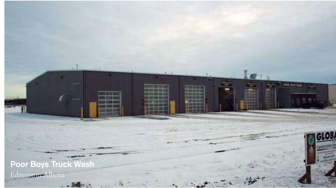
Poor Boys Truck Wash Edmonton, Alberta