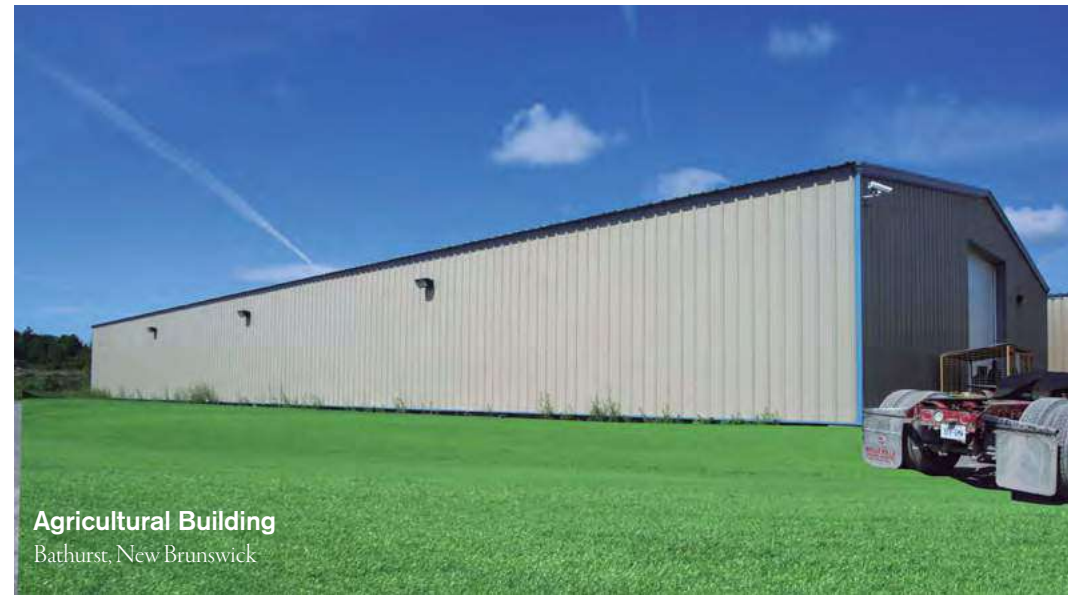
Agricultural Building Bathurst, New Brunswick