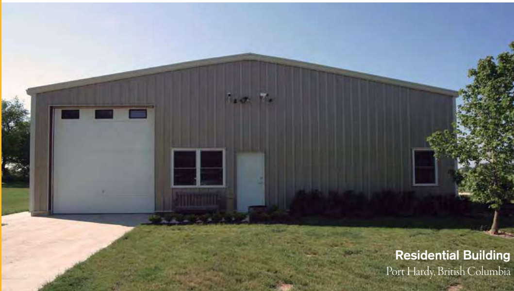
Residential Building Port Hardy, British Columbia