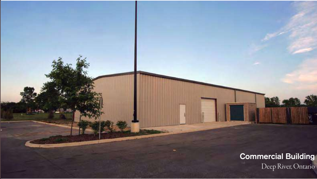
Commercial Building Deep River, Ontario