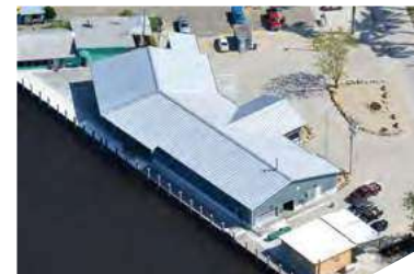
Standing Seam Roof Panels