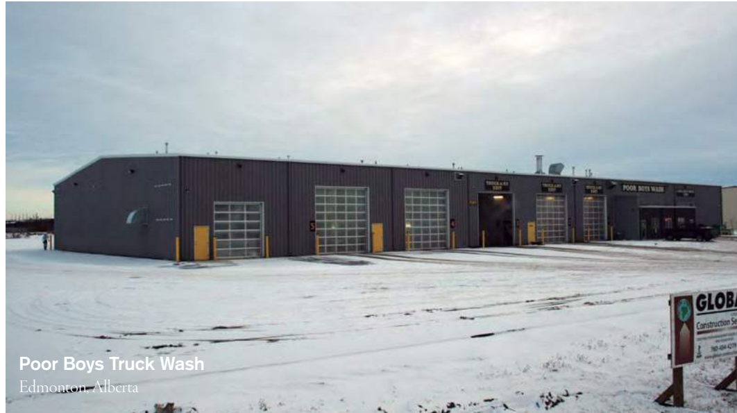
Poor Boys Truck Wash Edmonton, Alberta