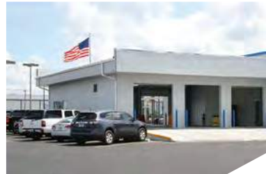
Gutters and Downspouts