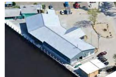
Standing Seam Roof Panels