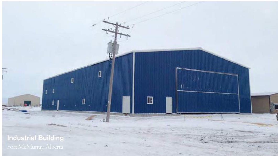
Industrial Building Fort McMurray, Alberta