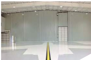
Interior Liner Panels