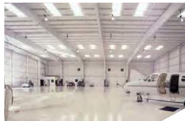
Light Transmitting Panels