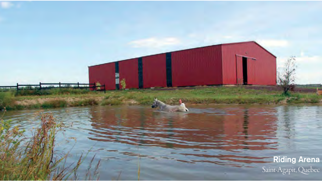
Riding Arena Saint-Agapit, Quebec