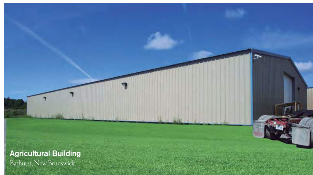
Agricultural Building Bathurst, New Brunswick