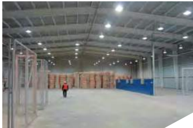
Gray Coat Primer